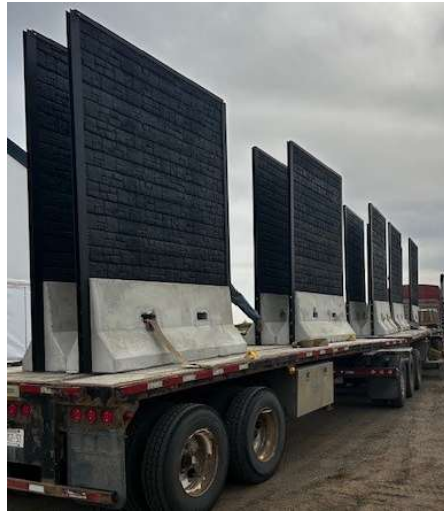
Saddle Wall 10 ft high x 8 ft wide