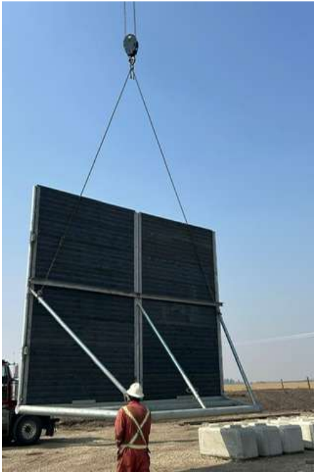
Razor Wall 16 ft high x 20 ft wide