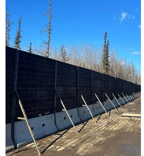
Saddle Wall HD 10 ft high x 10 ft wide